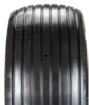
13" Grooved Polyresin Tread