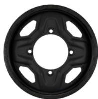
MSPN 75085 & 82599