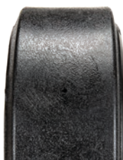
15" Smooth Polyresin Tread