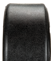
13" Smooth Polyresin Tread